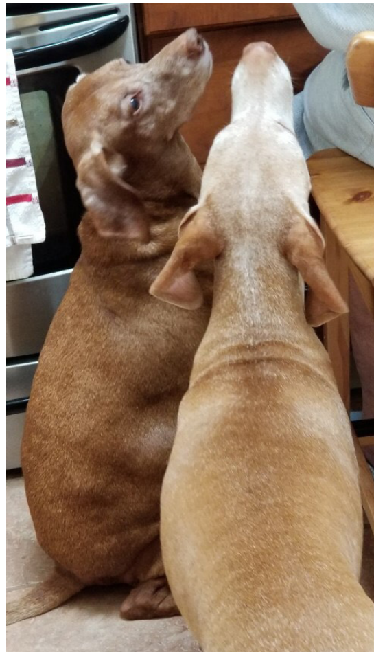
Rascal and his younger sister await some special home-cooked treats in the kitchen!

In addition, I was contacted by several homes seeking support and/or guidance in terms of resources or next steps for some behavioral challenges in the home, as well as additional information about how rescue works, and what happens when a dog is surrendered. I am always grateful when people find our rescue, as I am able to provide some assurance that if, "worst case" happens (for them), things will be okay, and the dog will