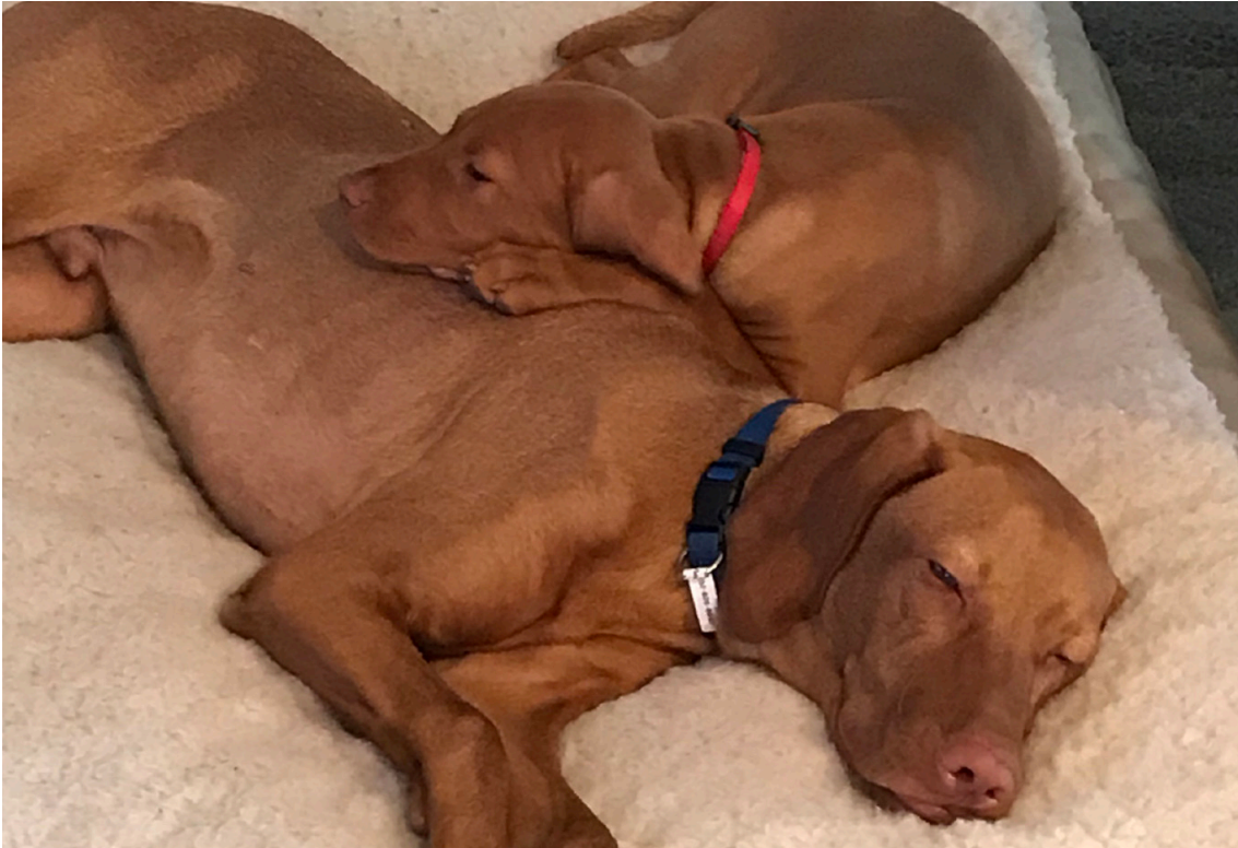
Remi is such a good big brother!