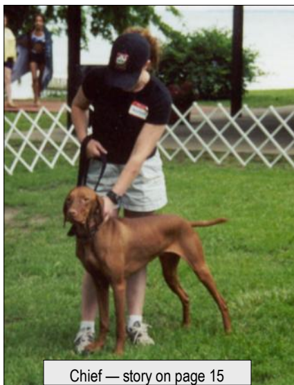
Chief — story on page 15