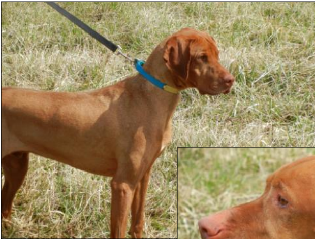
Xander, a 3-year-old whose humans "didn't have time for him"