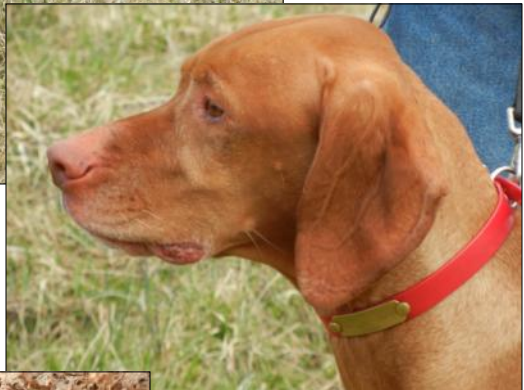
Bailey, a 6-year-old given up because of a house foreclosure