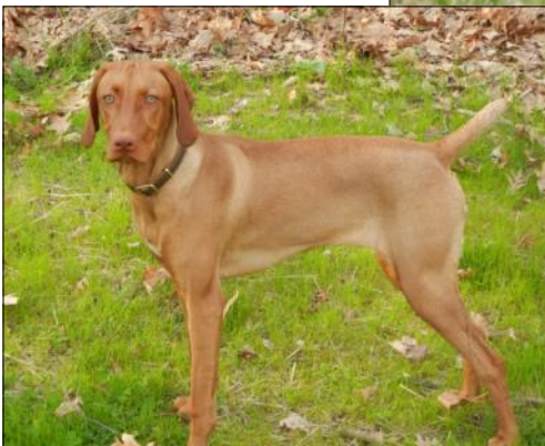
Buffy, a 7-month-old given up because "there wasn't enough room in the apartment"