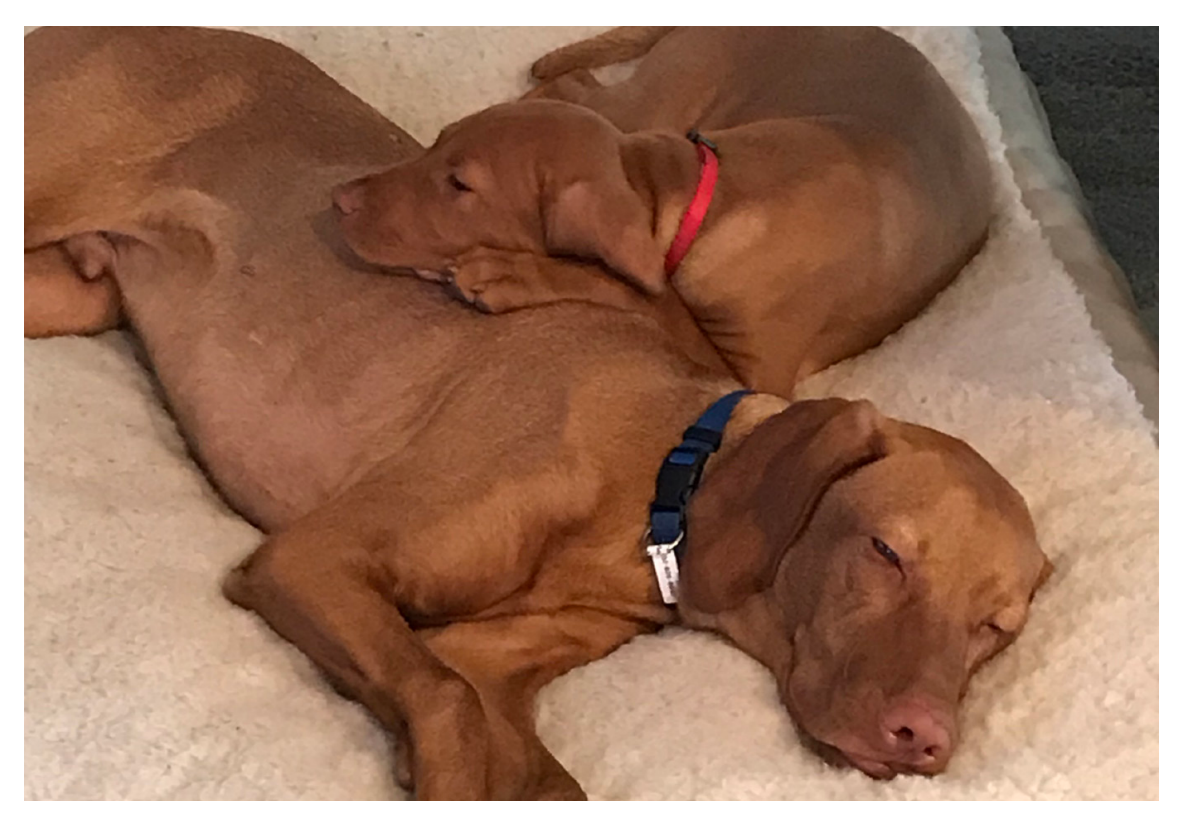
Remi is such a good big brother!